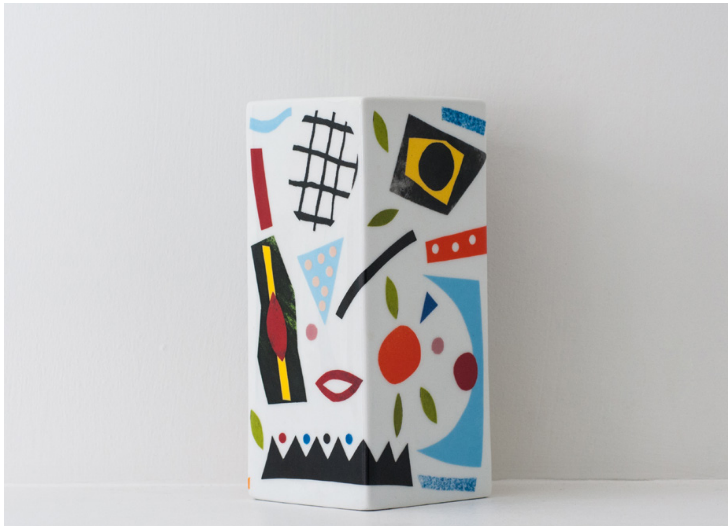
Cuboid Wildcuts Collection

Materials: Porcelain vase, silk screen, hand-decorated