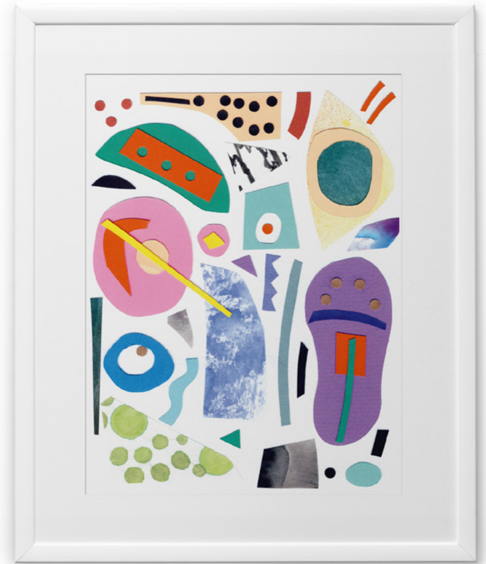
Paper cuts pattern by Eddy Chartier