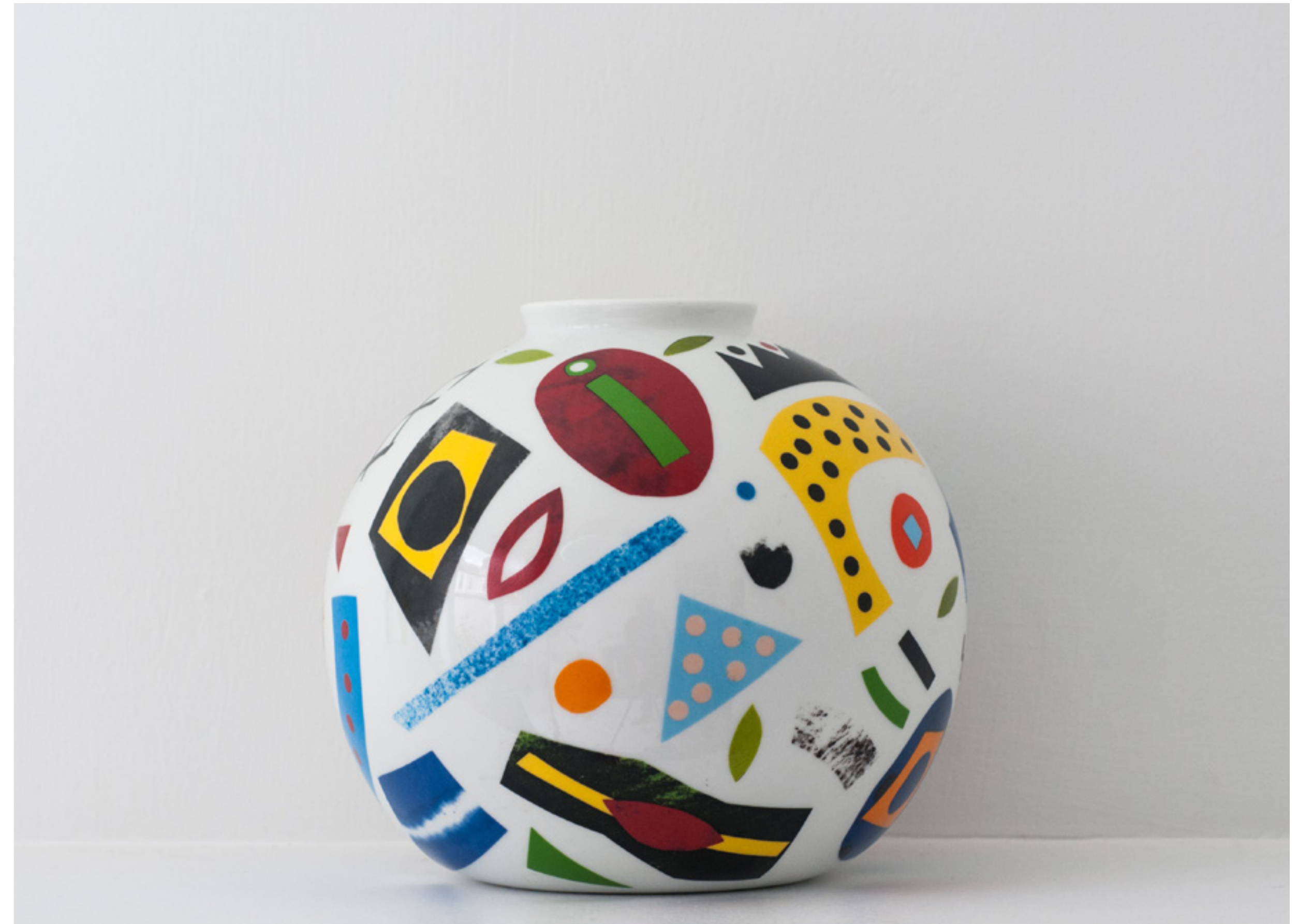
Sphere Wildcuts Collection

Materials: Porcelain vase, silk screen, hand-decorated